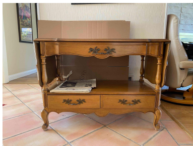
Maple wall table Sides come up to extend length