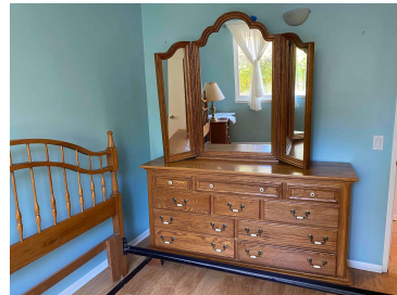
Dresser with mirror (uncentered)